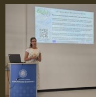
11th IcETRAN Niš (RS)