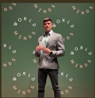
World Minds 2024 Belgrade (RS)

The 6SAVA consortium actively participated in conferences, workshops, fairs, stakeholder dialogues and podcasts across the region to raise awareness and foster collaboration.