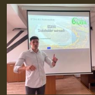
Horizon EU Info day Belgrade (RS)