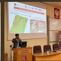
2nd Firefighter safety in rescue operations conf. Warsaw (PL)