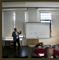
2024 Biomedical Engineering Days Novi Sad (RS)