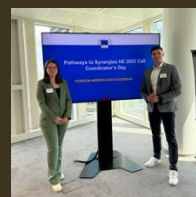
Pathways to Synergies Coordinator's Day Brussels (BE)