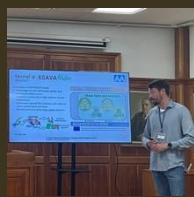
3rd Serbian Int. Conf. on Applied AI Kragujevac (RS)