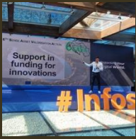
INFOSEC 2024 Conf. Budva (ME)