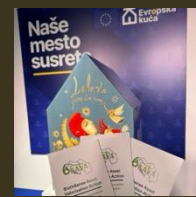
The Europe House opening Belgrade (RS)